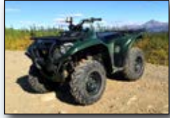
Yamaha Kodiak 1 rider