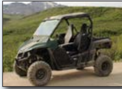
Yamaha Wolverine X2 ATV 2 riders