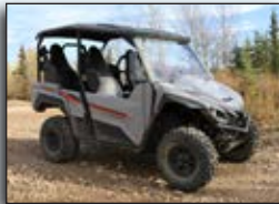
Yamaha Wolverine X4 ATV 4 riders