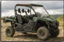
Yamaha Viking ATV 3 riders