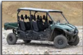
Yamaha Viking VI Crew ATV 5-6 riders

All ATVs are 4-wheel drive & automatic transmission. All Side x Side ATVs have a roof, windshield, half-doors & seat belts.